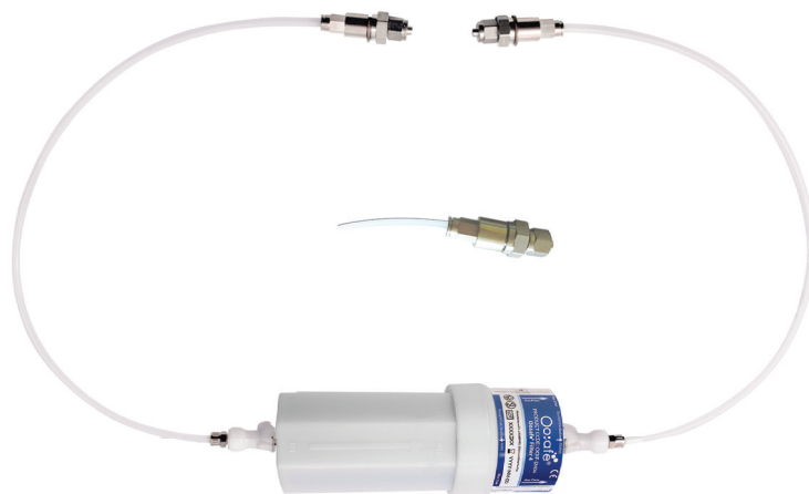
OOSAFE® FILTER CONNECTION SET FOR BENCHTOP INCUBATORS Product reference: OOFCS-MC