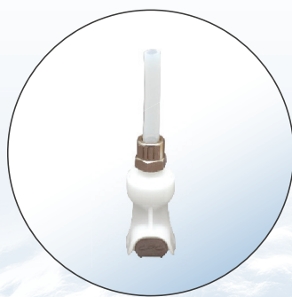
CONNECTOR for Oosafe® Filters 6 mm diameter hard tubing Product reference: AS-852086