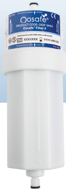
Oosafe® FILTER 4 (Replace every 4 months)