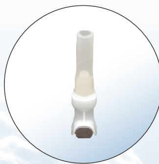
CONNECTOR for Oosafe® Filters 8 mm diameter soft tubing Product reference: AS-852085