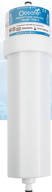
Oosafe® FILTER 6 (Replace every 6 months)