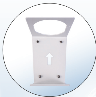
MAGNET HOLDER for Oosafe® Filters Product reference: OOHLD-01